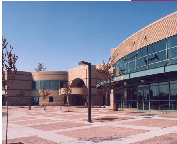
Sport & Leisure Complex